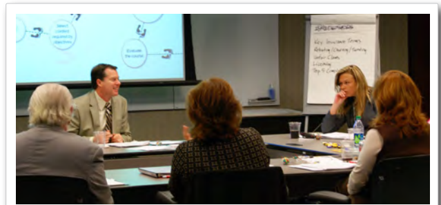
A team work session in Kansas City.