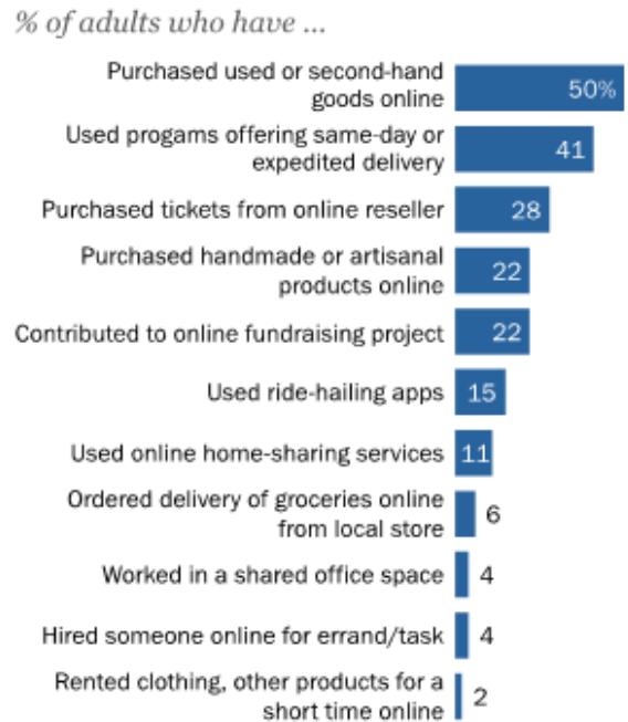
FIGURE 1: PERCENTAGE OF ADULTS WHO HAVE USED SOME TYPE OF ON-DEMAND SERVICE

And I'm not alone. The past several years have seen the rise of what has been variously referred to as the on-demand, collaborative, sharing or peer-to-peer economy. Companies